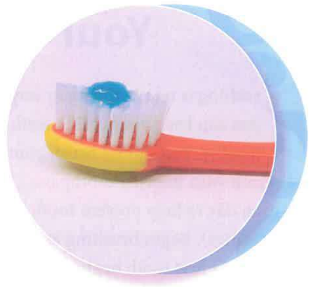
Use a pea-size amount for children ages 3 to 6.

..... This handout was prepared by the National Center on Early Childhood Health and Wellness under cooperative agreement #90HC0013 for the U.S. Department of Health and Human Services, Administration for Children and Families, Office of Head Start.