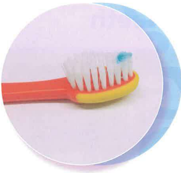
Use a smear for children under age 3.